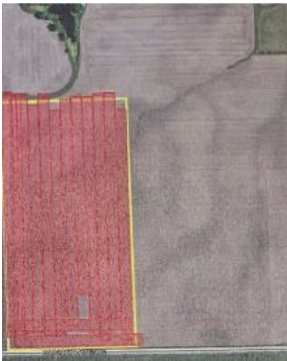
As-applied Map: Quadris Top SBX in red